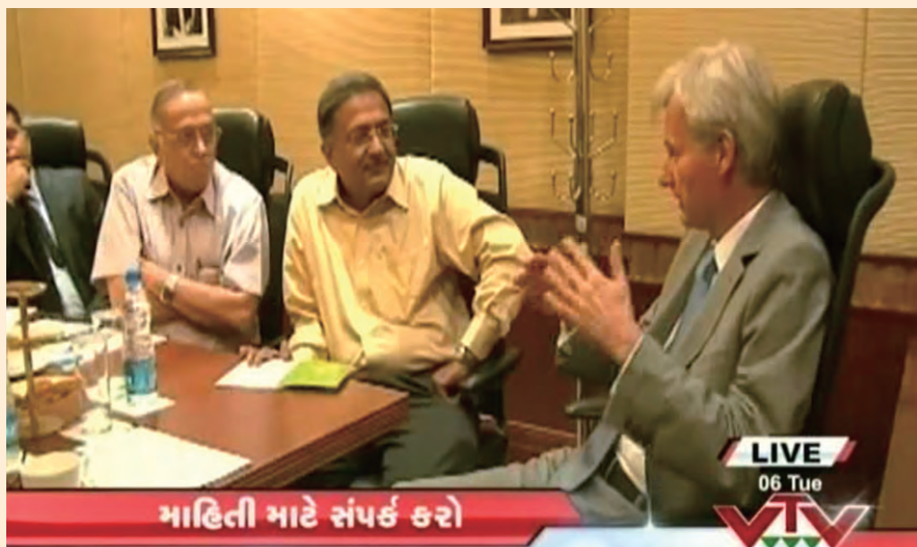
Television Talk Show - Total 20