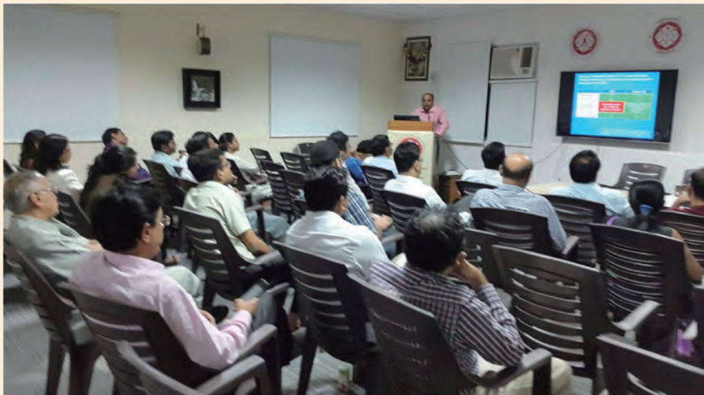
Doctors meeting at AC meeting hall - Total 10